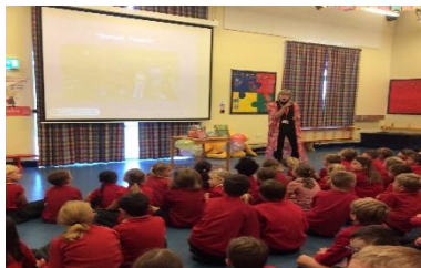
Roald Dahl Assembly

In Scorpions this week, we have been mastering division and begun our work on 'A Rumble in the Rainforest'