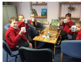
Hot chocolate Friday